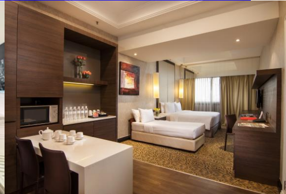
Family Room (42 sqm)