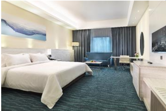
Deluxe Room (40 sqm)

FOR INDIVIDUAL BOOKING, PLEASE EMAIL TO: spkl.reservations@sunwayhotels.com