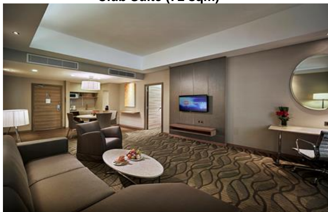
Club Suite Living Room (P2)